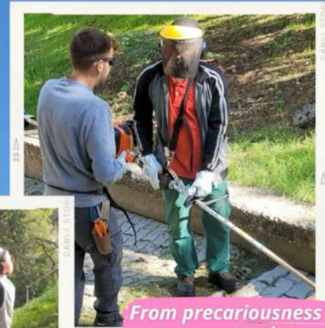
From precariousness to opportunity