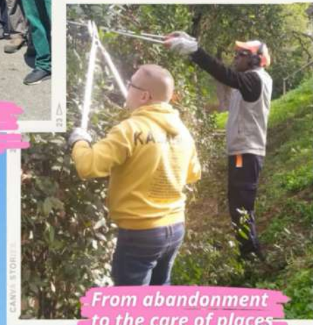
From abandonment to the care of places