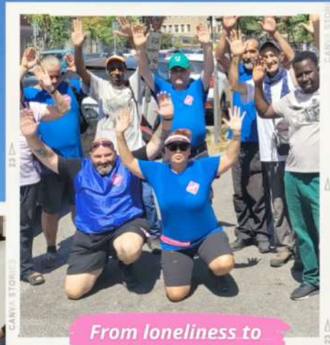
From loneliness to friendship