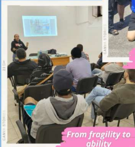
From fragility to ability